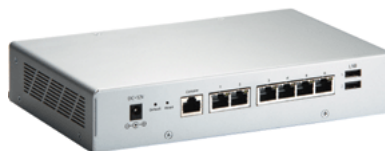
Truffle Lite Rear Panel