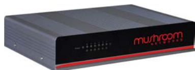
Truffle Lite Front Panel