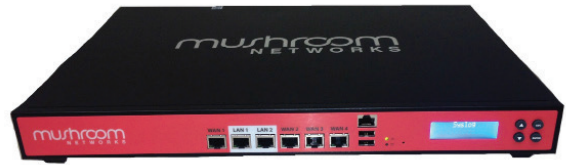
Streamer Relay Unit